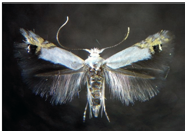
Fig.# 1 Paraleucoptera albella

Also, I am including a photograph of a micromoth Paraleucoptera albella with a 6mm wingspan. This was a single specimen in a light trap and it is a new species for me. These are often overlooked little jewels in light traps."