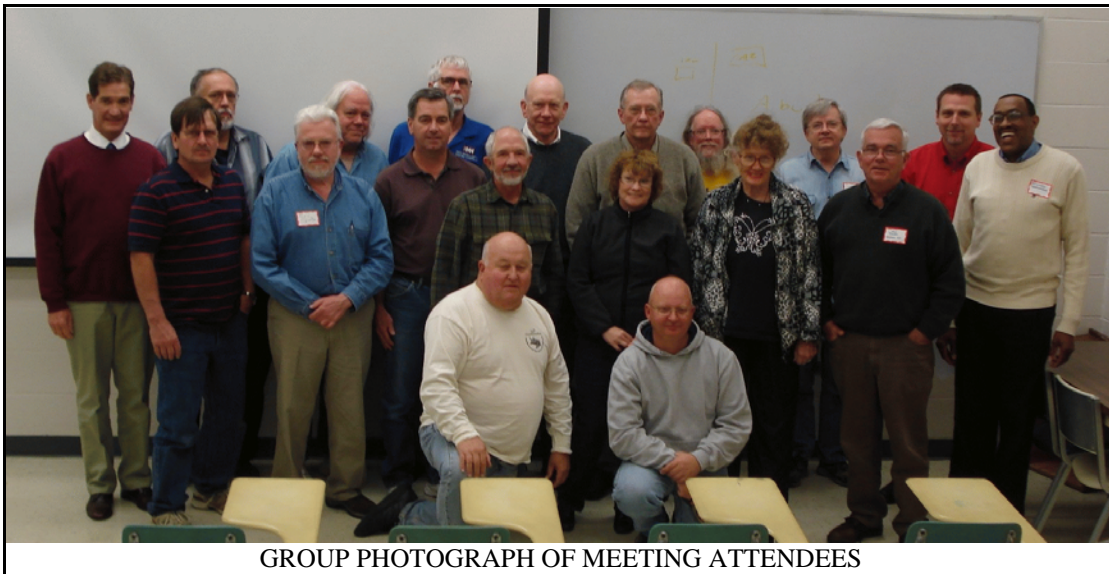
GROUP PHOTOGRAPH OF MEETING ATTENDEES