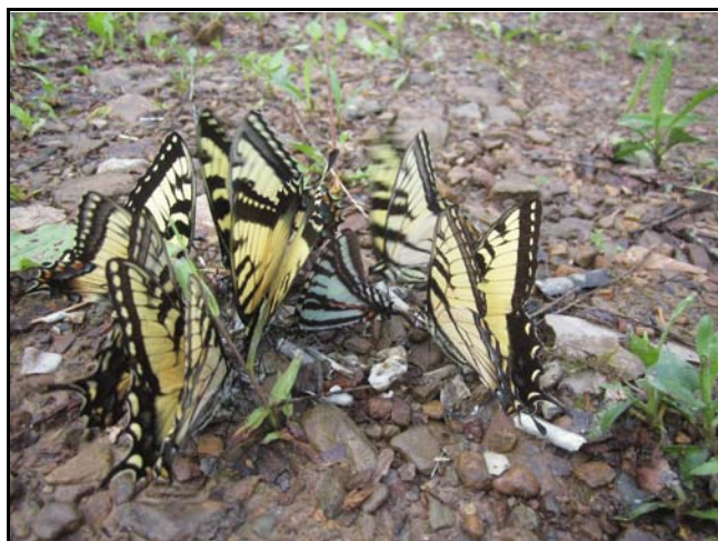
Swallowtails decomposing Scatt