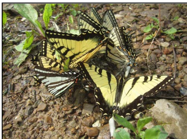
Swallowtails on dung.