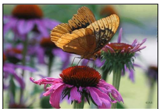
Speyeria diana visiting Purple Cone Flower in the yard of Rita Adkin's home in Menifee County 24 June 2012

The <u>Speyeria diana</u> male in the following photograph is the second individual recorded in her yard. The first individual was seen in 2008.